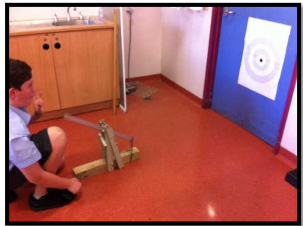
Year 7 TEP Class students displaying their constructions