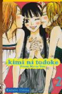
kimi ni todoke